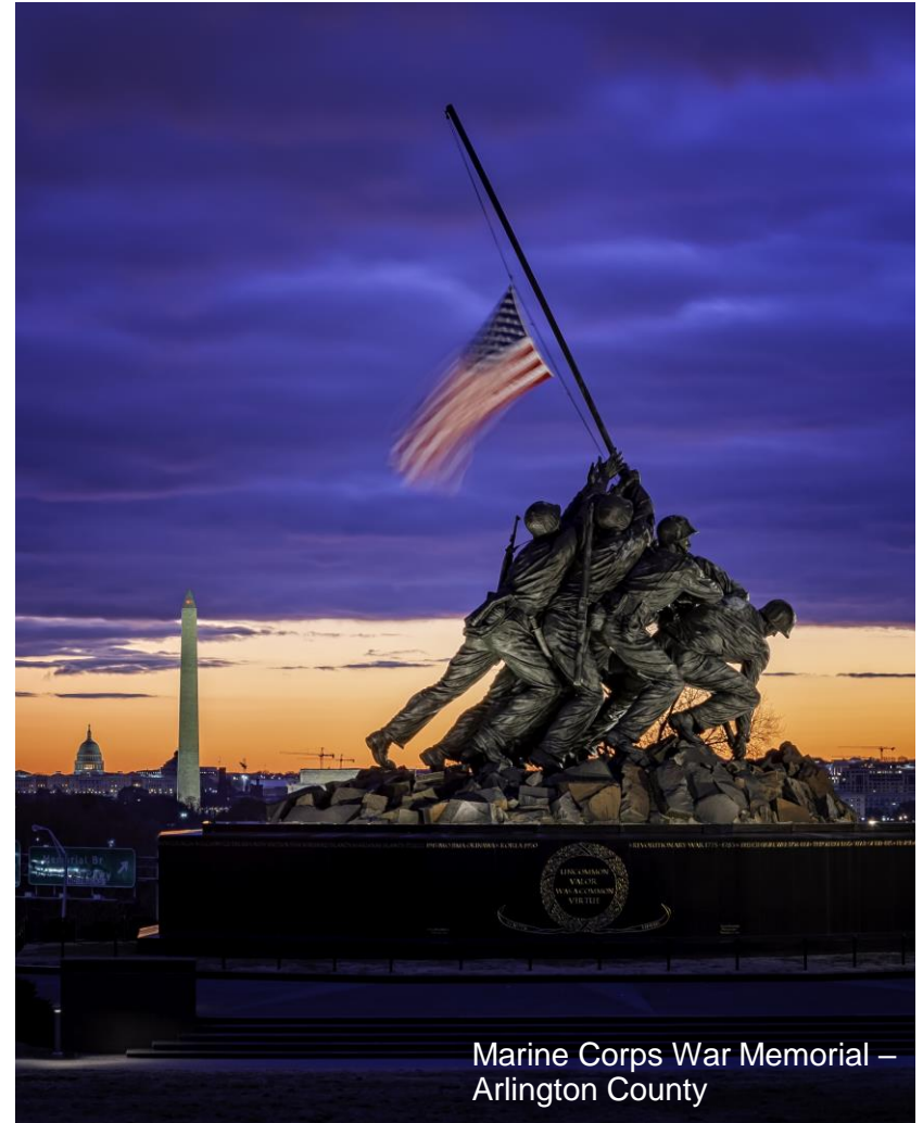
Marine Corps War Memorial – Arlington County