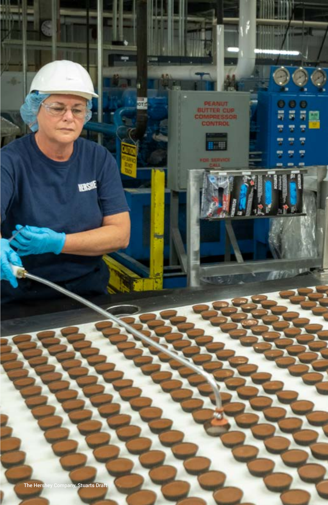
The Hershey Company, Stuarts Draft

Research and development tangible personal property; equipment used for biotechnology research, development, and production; semiconductor manufacturing machinery and tools; computer hardware and peripherals; aircraft; clean-fuel vehicles; tangible personal property used in the provision of certain internet services; tangible personal property owned by qualifying businesses in their first two taxable years; and energy-efficient buildings.