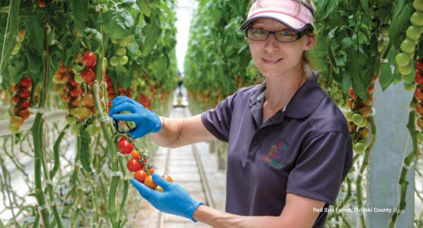
Red Sun Farms, Pulaski County

(Above) Red Sun Farms received support from the Governor's Agricultural and Forestry Industries Development Fund to establish its first U.S. high-technology greenhouse production operation in Pulaski County.