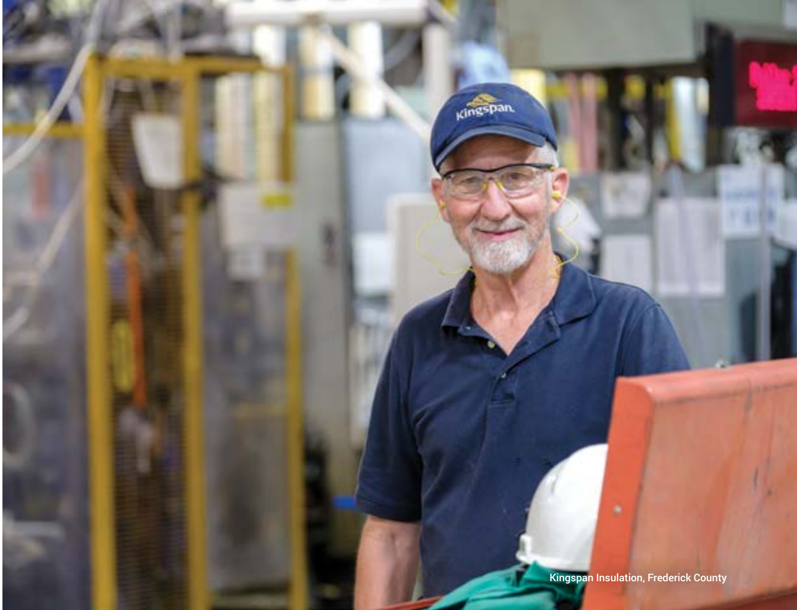
Kingspan Insulation, Frederick County