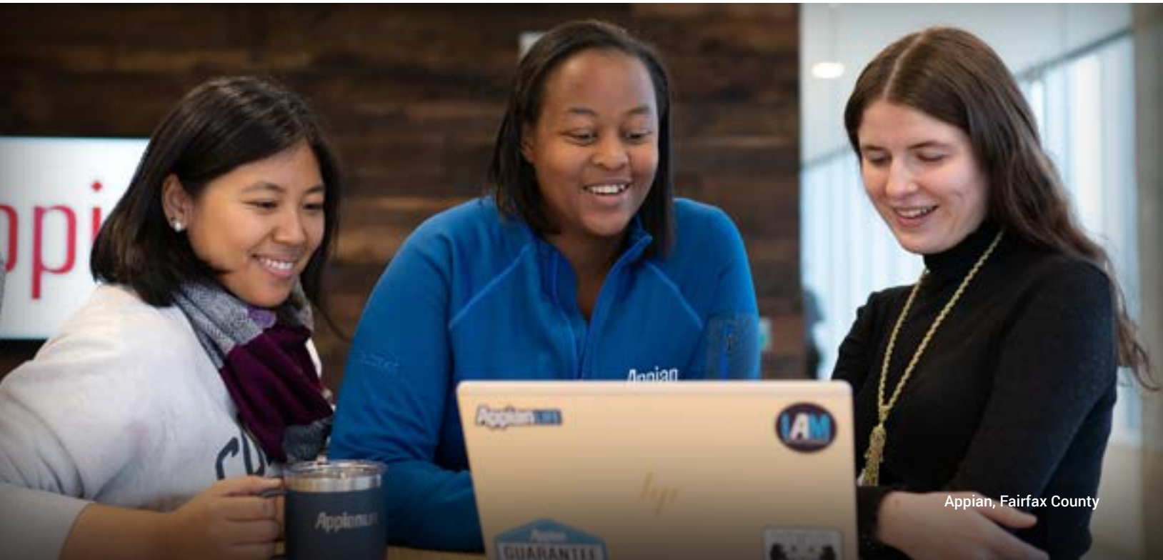
Appian, Fairfax County