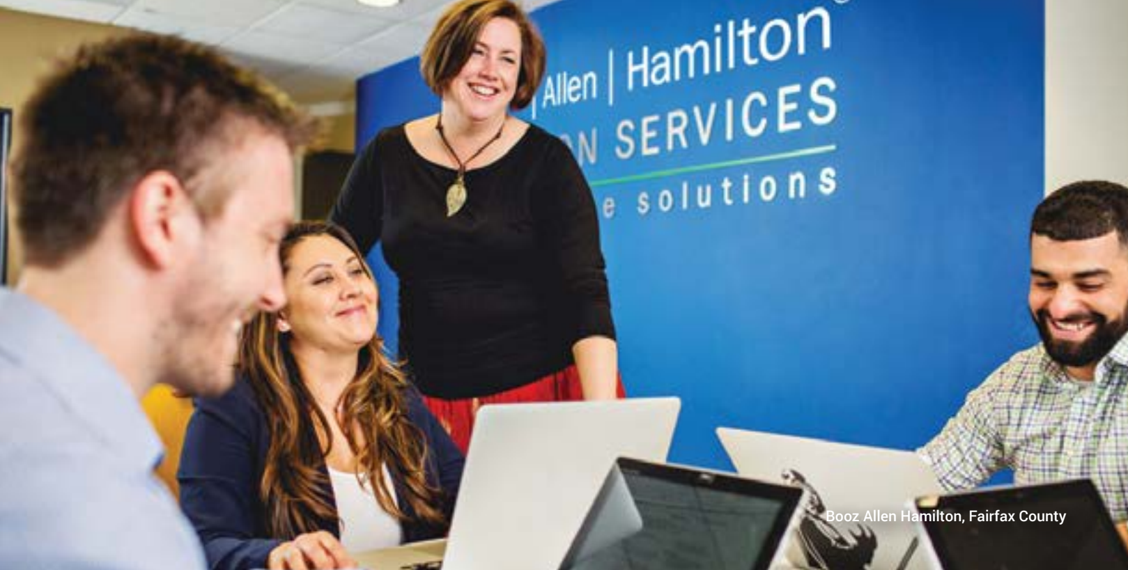
Booz Allen Hamilton, Fairfax County

(Above) Booz Allen Hamilton employs thousands of Virginians and received the Major Eligible Employer Grant among other incentives.