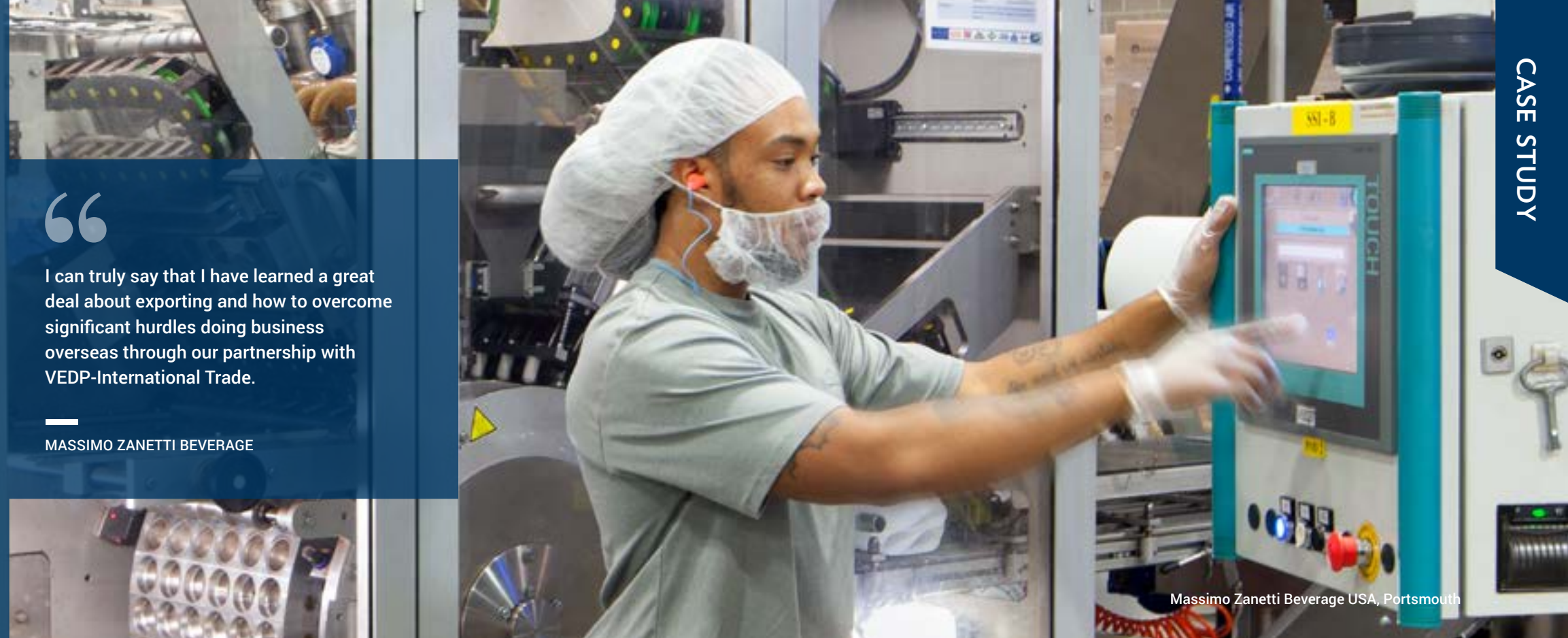
Massimo Zanetti Beverage USA, Portsmouth