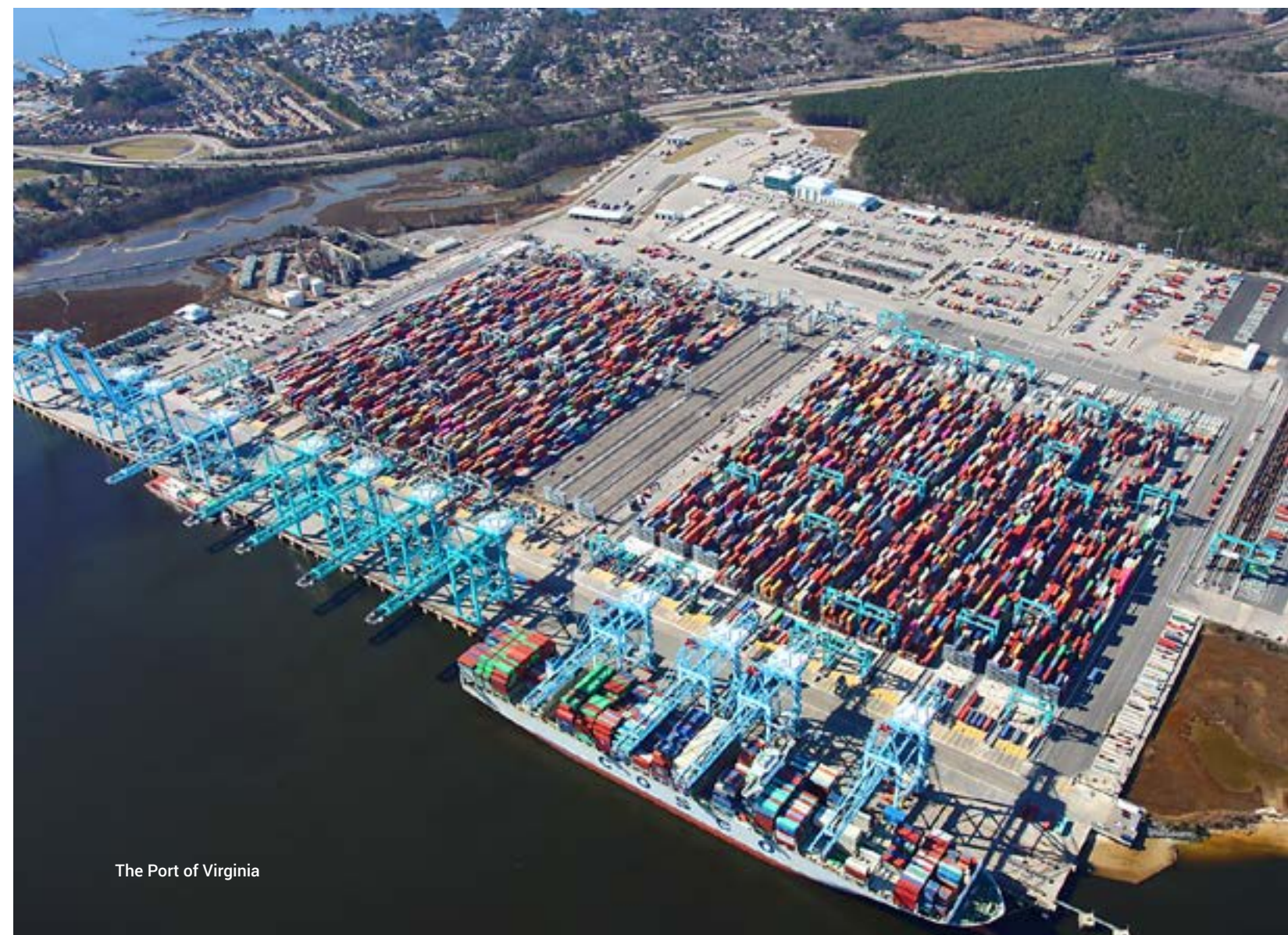
The Port of Virginia