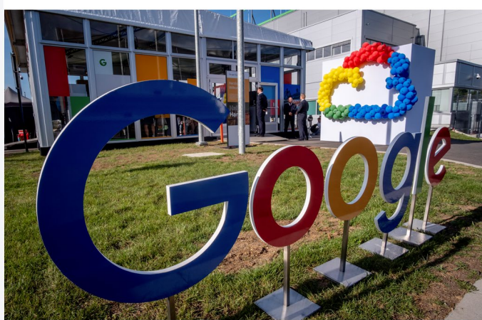
Google's first datacenter in Germany is pictured during its inauguration in Hanau near Frankfurt, Germany, Oct. 6, 2023.