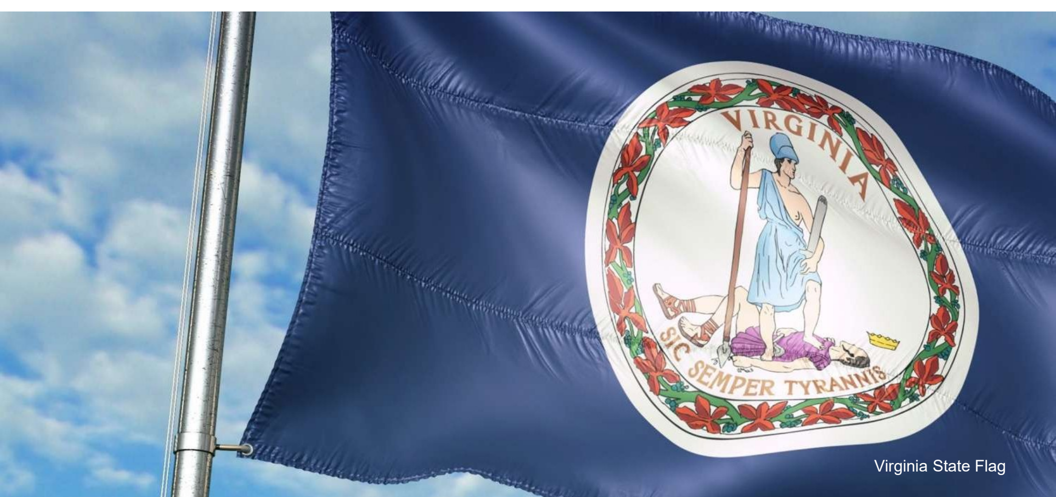
Virginia State Flag